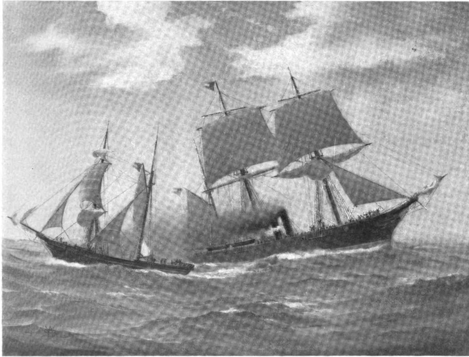
The Florida and Clarence Part Company

as a merchantman from England—of her arrival at Nassau, her arrest and release there; of the man-killing labor of putting aboard her guns and stores in the intense heat of midsummer at Green Cay; of the horrors of yellow fever, with which the crew were stricken as they worked, and the terrible labors of Lieutenant Maffitt, to succor the dying, there being no doctor on board; of the escape to Cardenas, where the ship lay for days helpless off the town, when scarce a man could raise his head, and even the commander was delirious from the fever; of the escape from watchful Federal gunboats, the arrival at Havana, the escape from there at night in the shadow of the wooded shore below the Morro, and of the dash past the blockaders into Mobile Bay, which was reached with the Florida's sails, rigging, spars and funnels in fragments and tatters, and her hull peppered with shot.