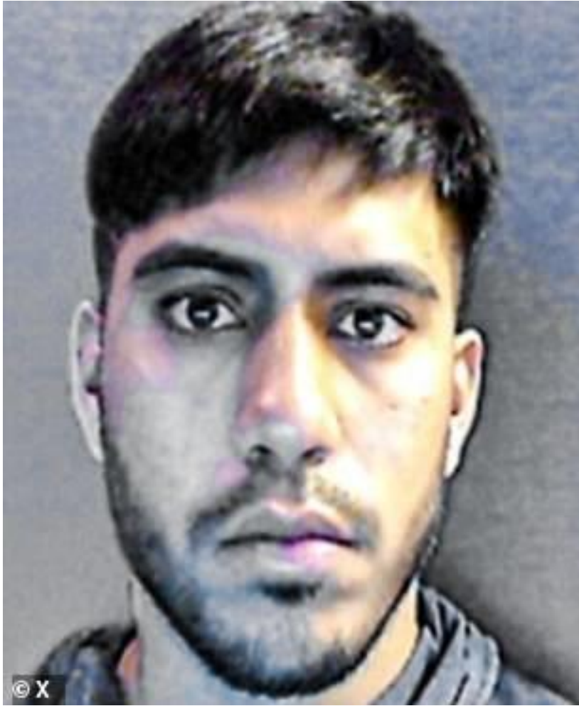
A Mexican national wanted for murder with an active INTERPOL Red Notice was arrested by ICE Los Angeles on January 24, 2025