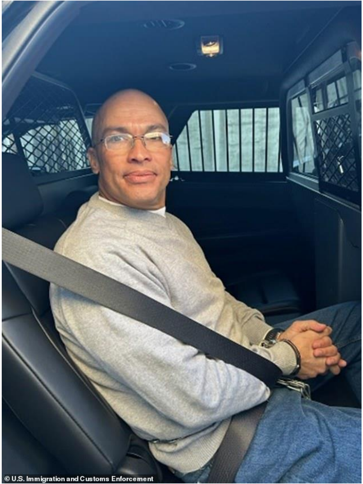
© U.S. Immigration and Customs Enforcement