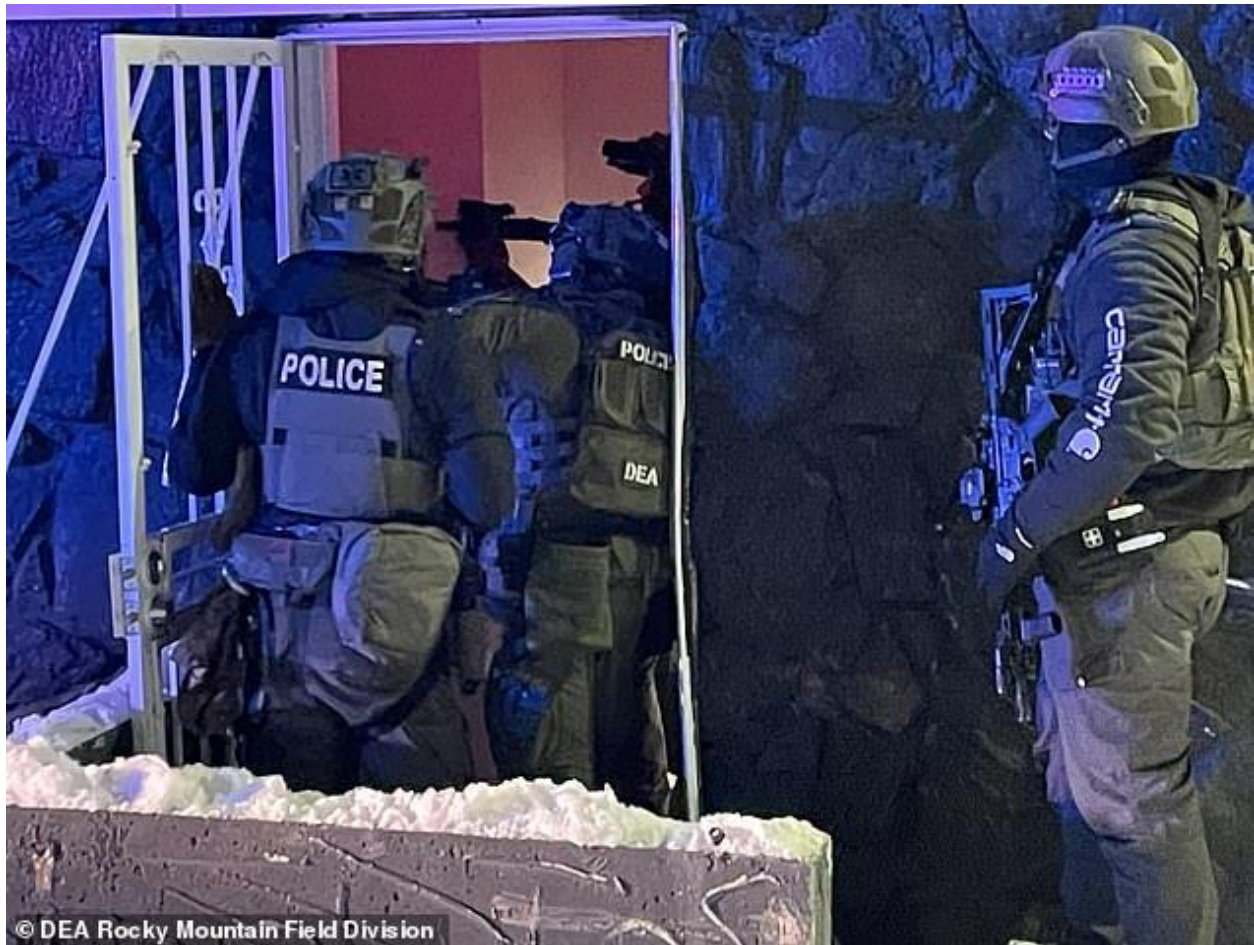
At least 50 illegal immigrants have been arrested during a raid on a Venezuelan Tren de Aragua gang party in Colorado on Sunday