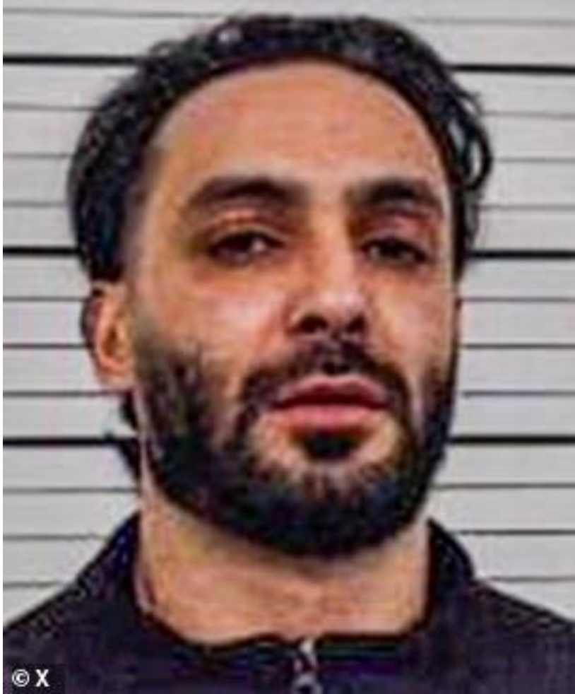
A Jordanian national with suspected ties to ISIS was arrested by ICE Buffalo on January 24, 2025