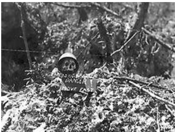
Front line warning sign using a Japanese soldier's skull on Peleliu October 1944

On the second day of Guadalcanal we captured a big Jap bivouac with all kinds of beer and supplies ... But they also found a lot of pictures of Marines that had been cut up and mutilated on Wake Island . The next thing you know there are Marines walking around with Jap ears stuck on their belts with safety pins. They issued an order reminding Marines that mutilation was a court-martial offense ... You get into a nasty frame of mind in combat. You see what's been done to you. You'd find a dead Marine that the Japs had booby-trapped. We found dead Japs that were booby-trapped. And they mutilated the dead. We began to get down to their level. [11]