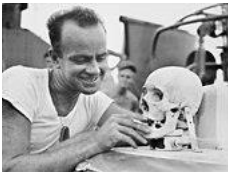
PT-341, Alexishafen , New Guinea, April 30, 1944

In October 1943, the U.S. High Command expressed alarm over recent newspaper articles covering American mutilation of the dead. Examples cited included one where a soldier made a string of beads using Japanese teeth and another about a soldier with pictures showing the steps in preparing a skull, involving cooking and scraping of the Japanese heads. [7]