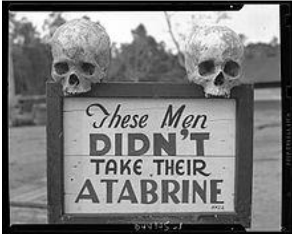
Hospital sign warning about neglect of Atabrine treatment, Guinea World War II

During World War II , some members of the United States military mutilated dead Japanese service personnel in the Pacific theater . The mutilation of Japanese service personnel included the taking of body parts as "war souvenirs" and " war trophies ". Teeth and skulls were the most commonly taken "trophies", although other body parts were also collected.