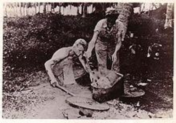
Skull stewing-Pacific War

Pictures showing the "cooking and scraping" of Japanese heads may have formed part of the large set of Guadalcanal photographs sold to sailors which were circulating on the U.S. West-coast. [47] According to Paul Fussel, pictures showing this type of activity, i.e. boiling human heads, "were taken (and preserved for a lifetime) because the Marines were proud of their success". [44]