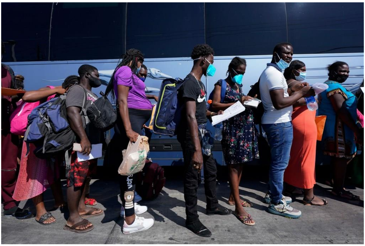
Migrants, many from Haiti, board a bus after they were processed and released after spending time at a makeshift camp near the International Bridge, on Monday, Sept. 20, 2021.

As if this weren't bad enough, now Democrats are demonizing Border Patrol agents in Texas who cleverly managed to close the gap across the Rio Grande, first by parking agency vehicles as a wall to stop migrants crossing, and then by riding horses into the water to turn people back — which is a standard crowd-control tactic.