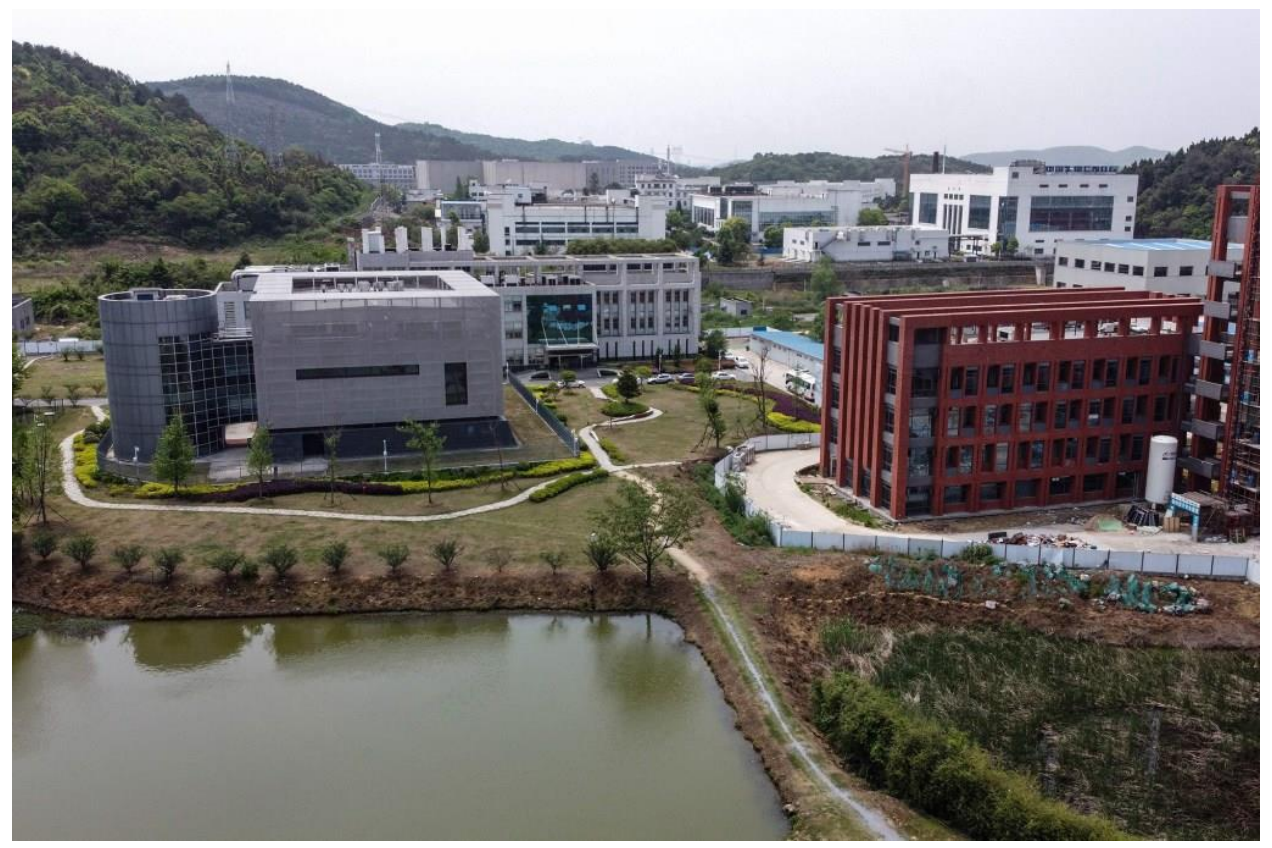
EcoHealth Alliance funneled taxpayer money to the Wuhan lab at the center of the COVID-19 pandemic.

The journal did a U-turn last week, publishing a letter from respected scientists asserting that there is more evidence of a lab leak than that the virus emerged spontaneously from nature: