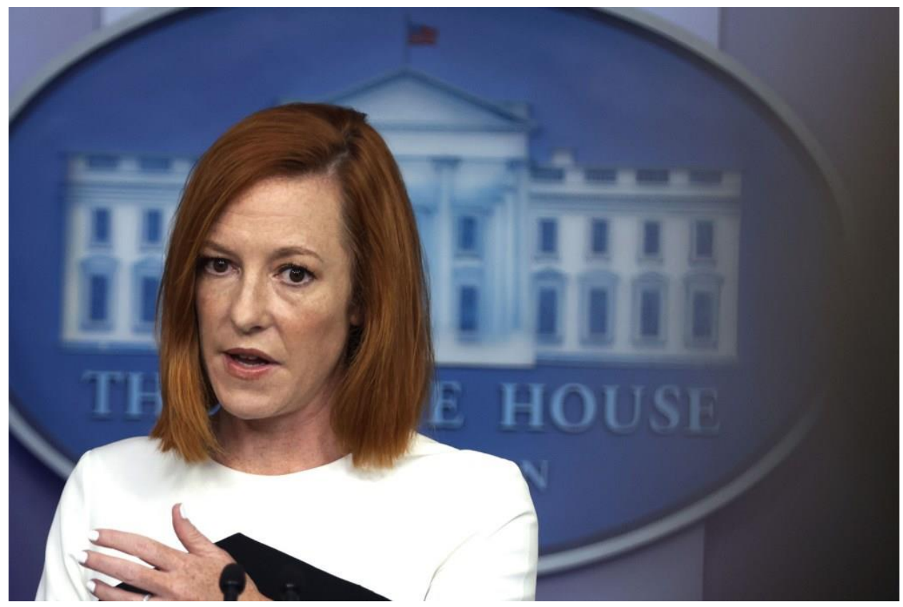
White House press secretary Jen Psaki said 90,000 migrants were deported in August.

Biden created this dumpster fire and refuses to face reporters and answer to the American people for the humanitarian catastrophe he has set in motion.