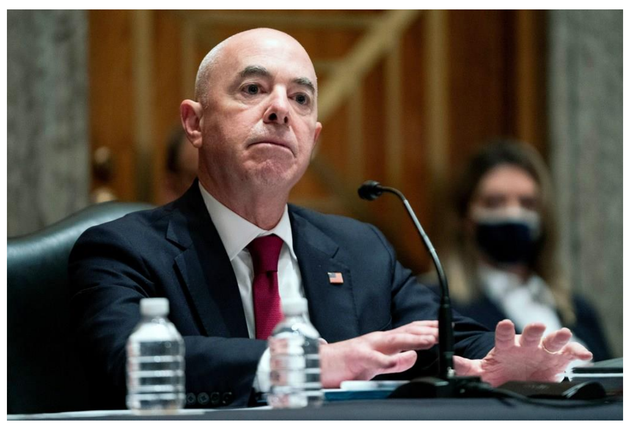
Secretary of Homeland Security Alejandro Mayorkas said the border is not open.

The White House did not respond to detailed questions about the numbers of migrants released, where they are sent in America, and how many are tested for COVID-19.