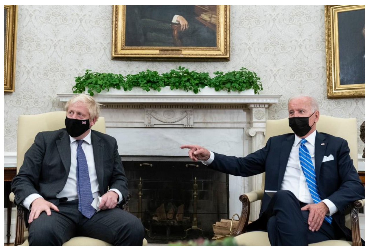
President Biden speaks during a meeting with British Prime Minister Boris Johnson in the Oval Office of the White House, on Tuesday, Sept. 21, 2021.

It's embarrassing that US media at the White House are treated worse than foreign media. It has become routine for the so-called wranglers to screech at and even physically push the press to stop them asking questions of the president after photo opportunities in the White House. Joe Biden seems to find the undignified melee amusing.