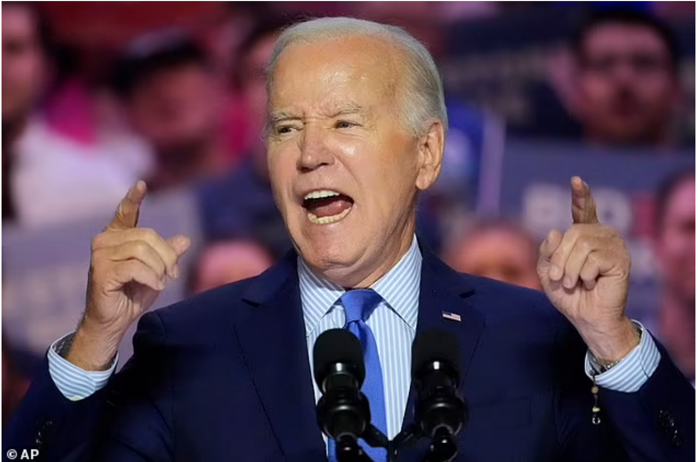
President Joe Biden speaks during an event on the campus of George Mason University in Manassas, Va

Biden has been repeatedly interrupted by protesters on the campaign trail, who refer to him as 'Genocide Joe' for standing with Israel and Prime Minister Benjamin Netanyahu as they pursue their war in Gaza after the October 7th terrorist attacks organized by Hamas .