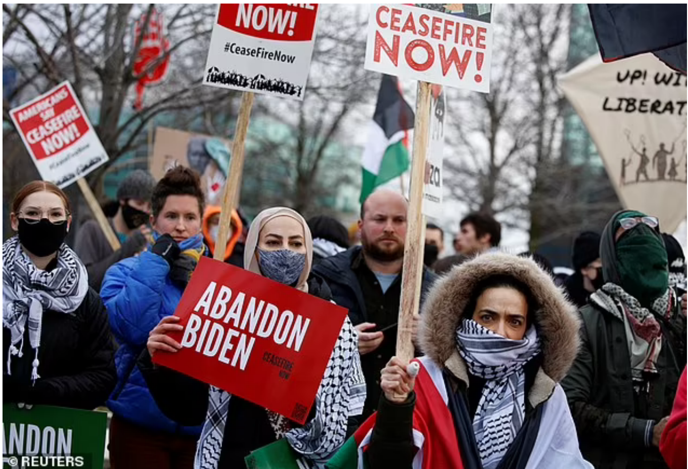
Thousands of pro-Palestine protestors march in Washington DC