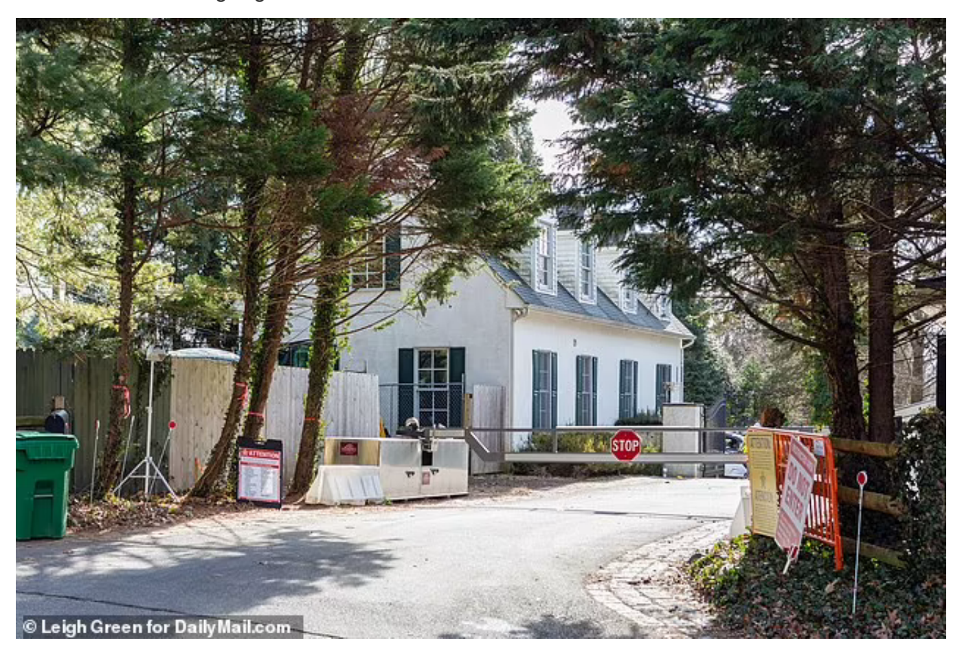
Biden called himself a 'frustrated archetect' and spoke at length about the contents of his home, even while failing to recall details about handling of government documents