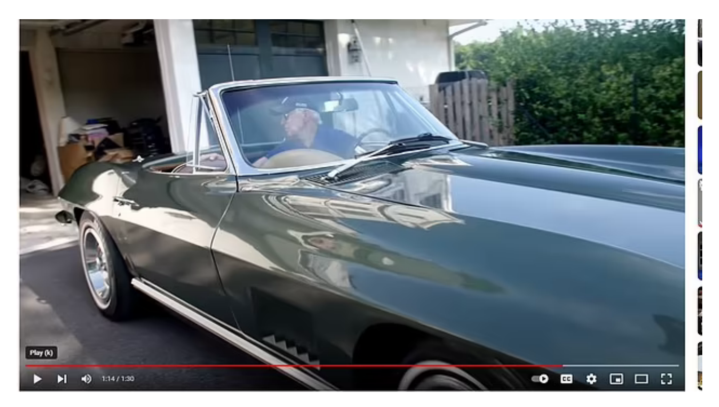
Don't look back: Biden regaled Hur with stories about his classic Corvette when asked about boxes of classified material in his garage