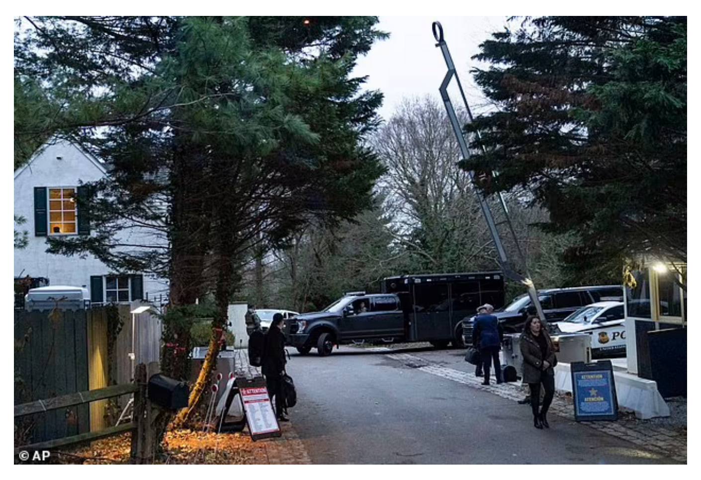
The Justice Department redacted information that might reveal security information about the orientation of his home