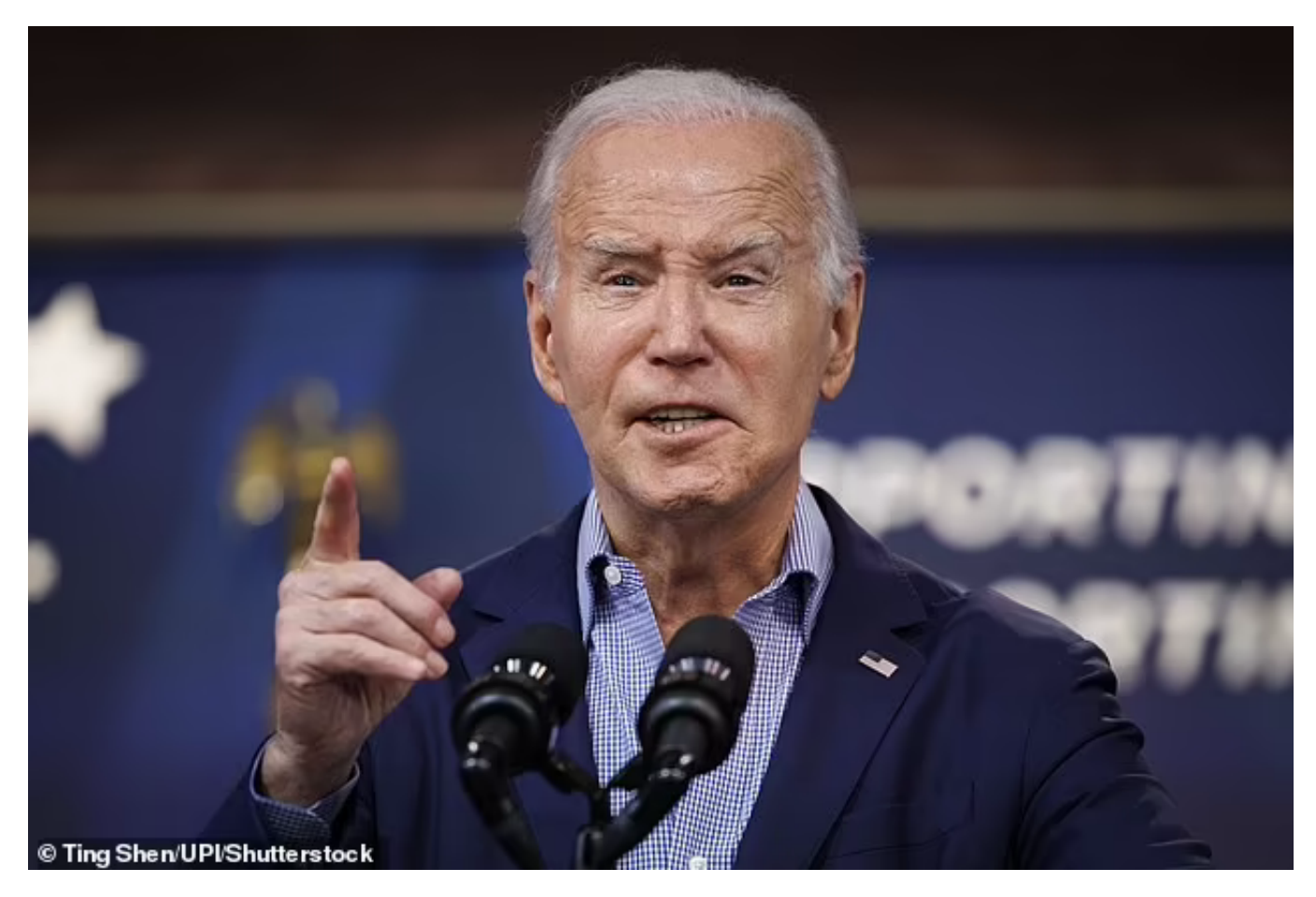
Biden said the move would allow former students to 'reach their dreams'

Biden said: 'In the wake of the Supreme Court's decision on our student debt relief plan we are continuing to pursue an alternative path to deliver student debt relief to as many borrowers as possible as quickly as possible.