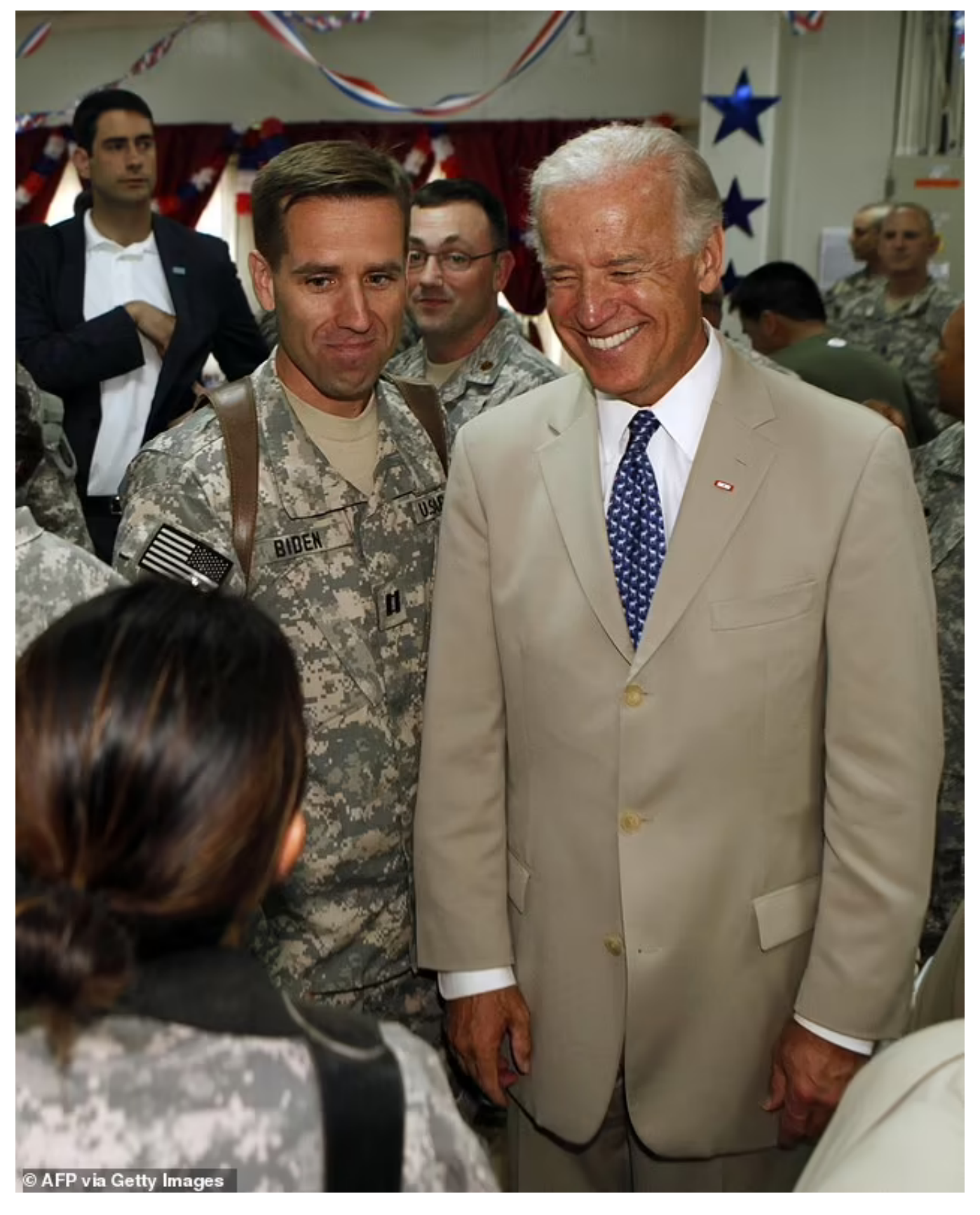
The mix-up of Beau's death date during the interview directly contradicts Biden's fiery denial that it ever occurred