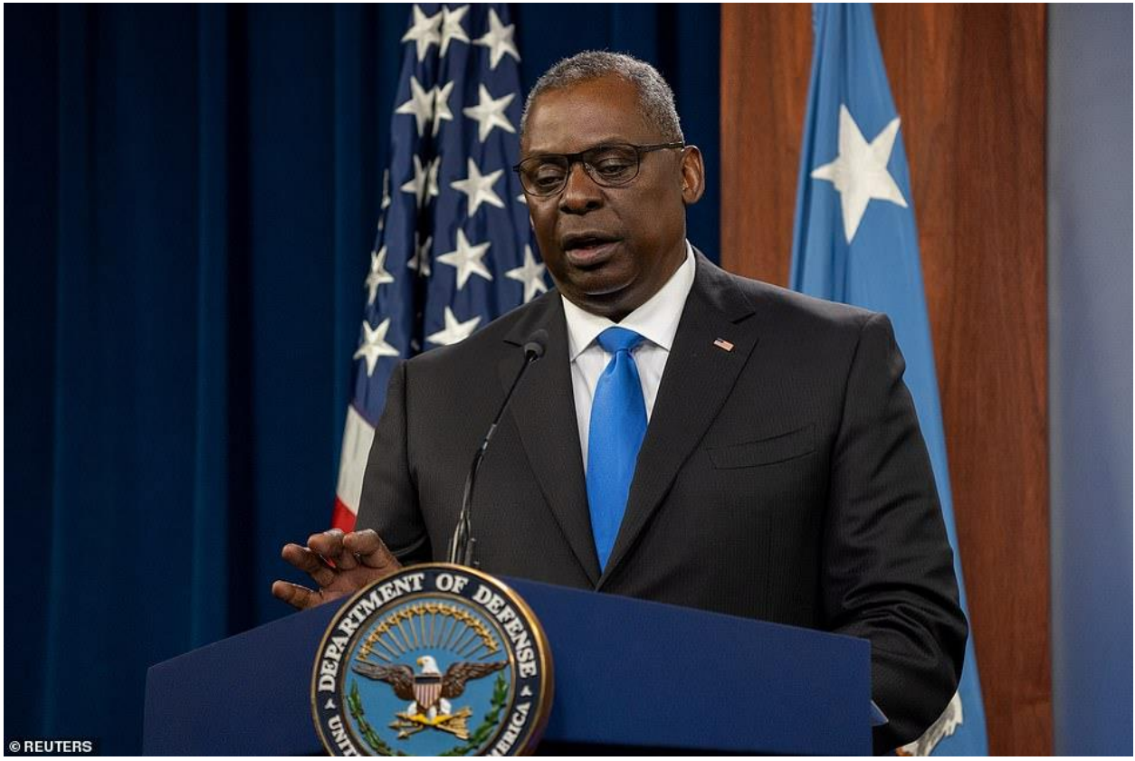
Biden met with Defense Sec. Lloyd Austin. The Pentagon confirmed Tuesday that it has a channel of communication with the Taliban

Lawmakers from Biden's own party are continuing to fume about the unfolding chaos in Afghanistan and firing up probes where they will demand answers from the Democratic administration.