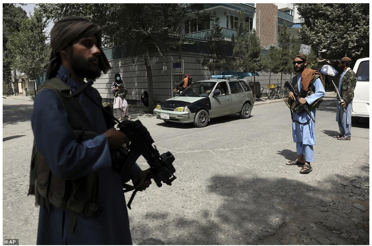
Taliban fighters stand guard at a checkpoint in the Wazir Akbar Khan neighborhood in the city of Kabul, Afghanistan, Wednesday, Aug. 18, 2021