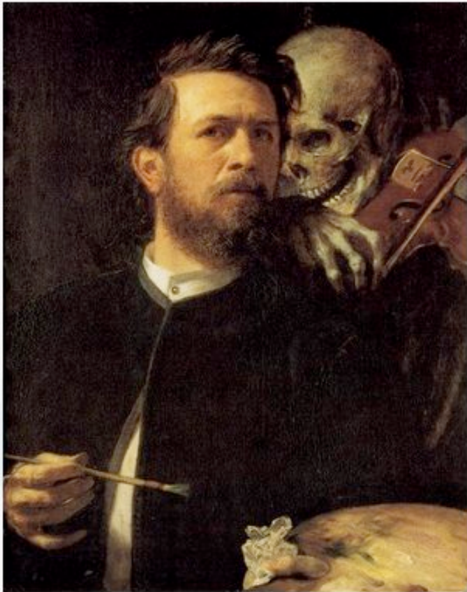
“Self-portrait with Fiddling Death,” by Arnold Böcklin 1872

This is perhaps the most insidious of all the heretical deceptions to biblical Christianity. It is characterized by catering to the desires of the people. Instead of being inculcated with God’s Word and having our personal world view and behavior be patterned after God’s Word, The New Evangelicalism, Seeker Sensitive, Emergent Church gives the people what they want.