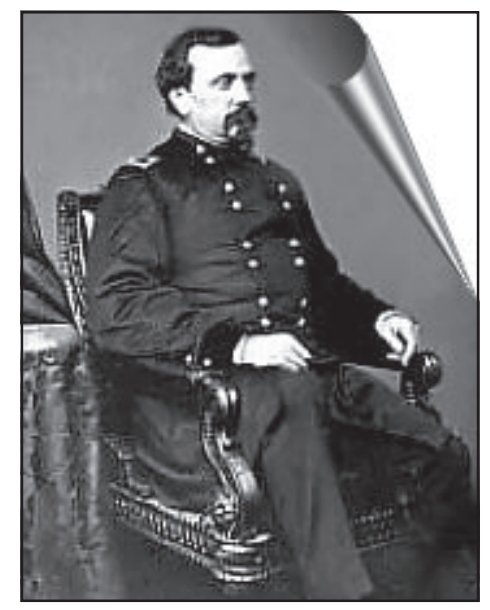
Figure 5: General Orville Babcock

The "femme fatal" of the Great Whiskey Ring was a St. Louis woman of easy virtue named Louise "Lou" Hawkins, who ultimately would become known to millions of Americans simply as "The