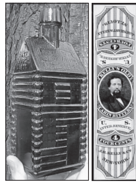
Figure 3 (L): Old Cabin Bitters Bottle Figure 4 (R): Kelly's "Proprietary" Revenue Stamp

peaked roof. It is a Kelly's Old Cabin Bitters [Figure 3]. Examples have sold to bottle collectors in recent months at prices approaching $2,000. Kelly was James B. Kelly of New York, a whiskey man, who is shown on a self-produced "proprietary" revenue stamp [Figure 4]. This is an ironic touch since it was an attempt to evade federal revenues on alcohol that lay at the heart of the Great Whiskey Ring.