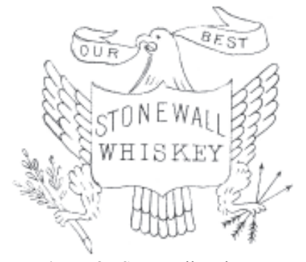
Figure 8: Stonewall Jackson whiskey ad

After the Civil War, both Southern and Northern generals were honored with their names on whiskey bottles. For example, General Stonewall Jackson, a Confederate leader killed in battle, had two whiskeys named for him. One, as shown in an ad here, [Figure 8] was "General Stonewall," a product of the B.B. Davies Company of New York City. "Stonewall Jackson" whiskey by contrast