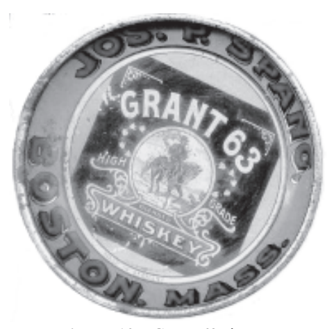
Figure 10: Grant 63 tip tray

A particularly interesting ad for "Grant 63" appeared on a blotter given away by the company. It shows a bellhop