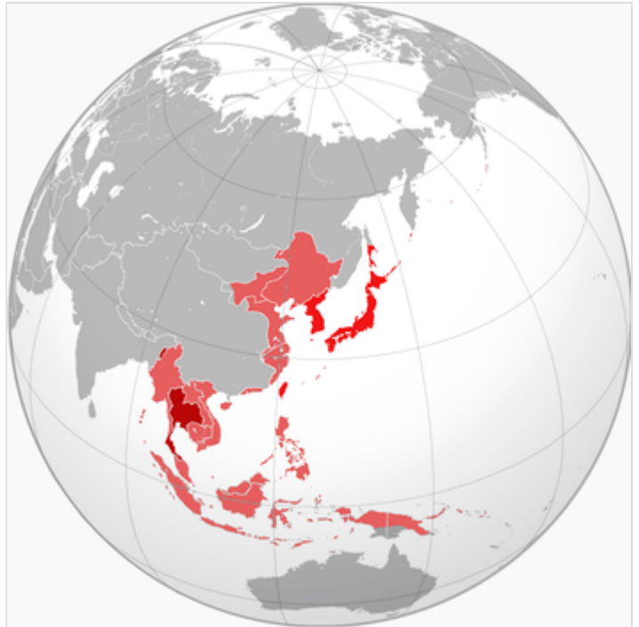
Members of the Greater East Asia Co-Prosperity Sphere and territories occupied by the Japanese army at maximum height in 1942. Japan and its Axis allies Thailand and Azad Hind are in dark red; occupied territories/puppet states are in lighter red. Korea , Taiwan , Karafuto (South Sakhalin) , and Kuril were integral parts of Japan.

For example, Toyotomi Hideyoshi proposed to make China, Korea, and Japan into "one". Modern conceptions emerged in 1917. During the proceedings of the Lansing-Ishii Agreement , Japan explained to Western observers that their expansionism in Asia was analogous to the United States' Monroe Doctrine . [3] This conception was influential in the development of the Greater East Asia Co-Prosperity