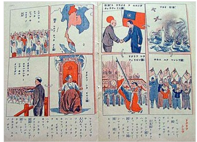
Fragment of a Japanese propaganda booklet published by the Tokyo Conference (1943), depicting scenes of situations in Greater East Asia, from the top, left to right: the Japanese occupation of Malaya , Thailand under Plaek Phibunsongkram gaining the territories of Saharat Thai Doem , the Republic of China under Wang Jingwei allied with Japan, Subhas Chandra Bose forming the Provisional Government of Free India , the State of Burma gaining independence under Ba Maw , the Declaration of the Second Philippine Republic , and people of Manchukuo

The militarists saw everything only from a Japanese perspective and, even worse, they insisted that all others dealing with them should do the same. For them, there was only one way to do a thing, the Japanese way; only one goal and interest, the Japanese interest; only one destiny for the East Asian countries, to become so many Manchukuo or Korea tied forever to Japan. This racial impositions ... made any real understanding between the Japanese militarists and the people of our region virtually impossible. [37]