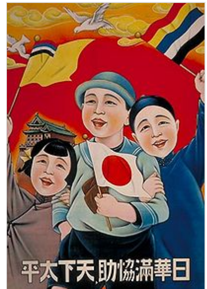
1935 propaganda poster of Manchukuo promoting harmony between Japanese , Chinese , and Manchu . The caption from right to left says: "With the help of Japan, China, and Manchukuo, the world can be in peace." The flags shown are, right to left: the " Five Races Under One Union " flag of China , the flag of Japan , and the flag of Manchukuo .

On June 29, 1940, Arita renamed the union the Greater East Asia Co-Prosperity Sphere , which he announced by radio address. At Yōsuke Matsuoka's advice, Arita emphasised on the economic aspects more. On August 1, Konoe, who still used the original name, expanded the scope of the union to include the territories of Southeast Asia. [3] On November 5, Konoe reaffirmed that a Japan–Manchukuo–China yen bloc [10] would continue and be "perfected". [3]