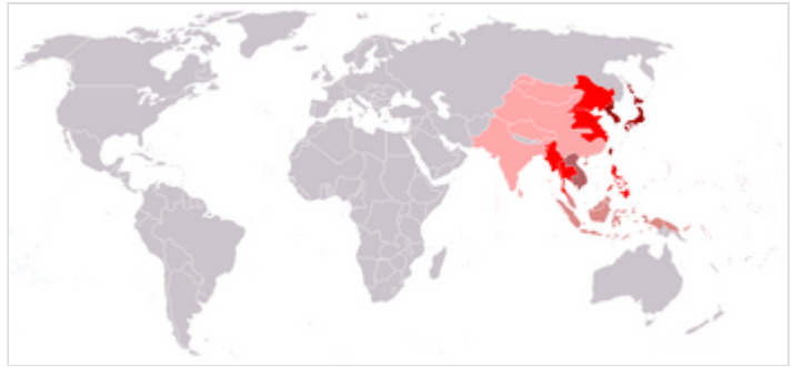
Attendees of the Greater East Asia Conference

With the simultaneous use of Wilsonian and Pan-Asian rhetoric, the goals of the conference were to solidify the commitment of certain Asian countries to Japan's war effort and to improve Japan's world image; however, the representatives of the other attending countries were in practice neither independent nor treated as equals by Japan. [26]