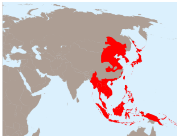
The Greater East Asia Co-Prosperity Sphere at its greatest extent

No military defeat could then have robbed her of the trust and gratitude of half of Asia or even more, and that would have mattered a great deal in finding for her a new, great, and abiding place in a postwar world in which Asia was coming into her own. [39]