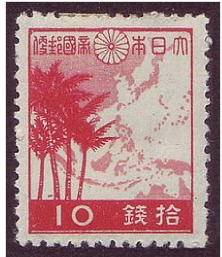
A Japanese 10 sen stamp from 1942 depicting the approximate extension of the Greater East Asia Co-Prosperity Sphere

The Micronesian islands that had been seized from Germany in World War I and which were assigned to Japan as C-Class Mandates , namely the Marianas , Carolines , Marshall Islands , and several others do not figure in this project. [46] They were the subject of earlier negotiations with the Germans and were expected to be officially ceded to Japan in return for economic and monetary compensations. [46]