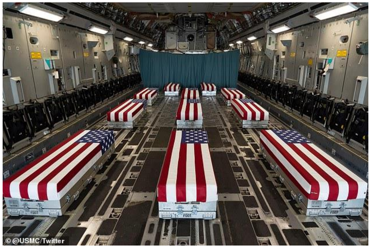
The US Marine Corps posted a photo to Twitter Sunday evening, of the flag flag-draped caskets of their fallen brethren killed in Thursday's suicide bomb attack in Kabul

'Considering especially the time and why we were there, I found it to be the most disrespectful thing I've ever seen.'