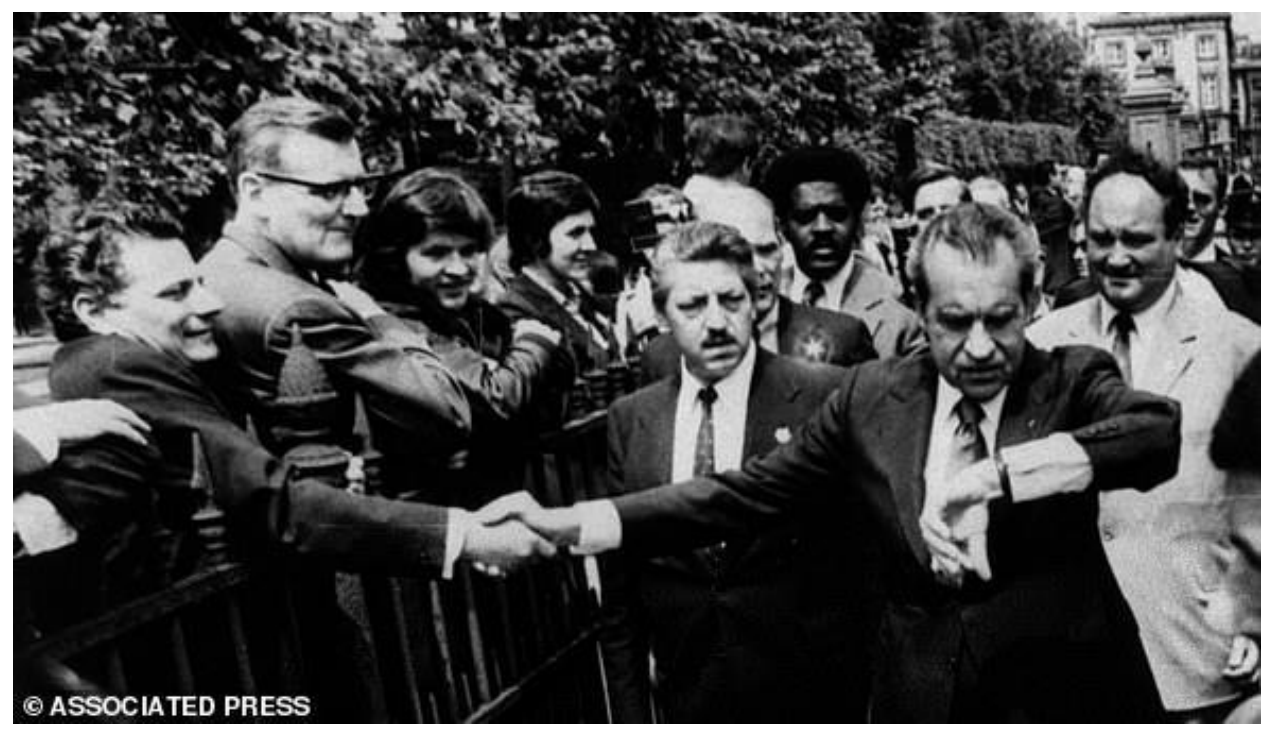
Pictured: Nixon checks his watch as he shakes hands with a member of the public in Brussels, 1974

But as Nixon - followed closely his secret service security detail - shook one man's hand, he lifted his left arm up to check his watch, seemingly more concerned with keeping his busy schedule.