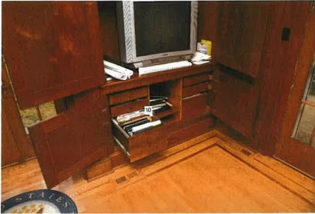
Office file cabinet under television containing eight seized notebooks (Jan. 20, 2023) 625