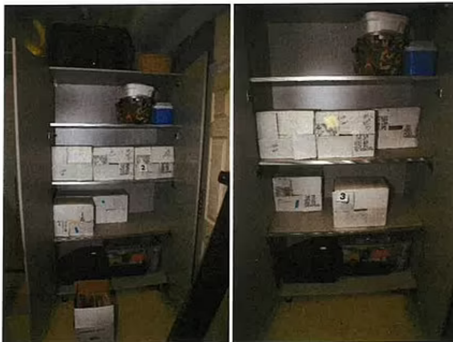
Interior of Mr. Biden's garage storage closet containing Senate documents (Jan. 20, 2023) 710

That was because jurors would conclude he had 'diminished faculties'.