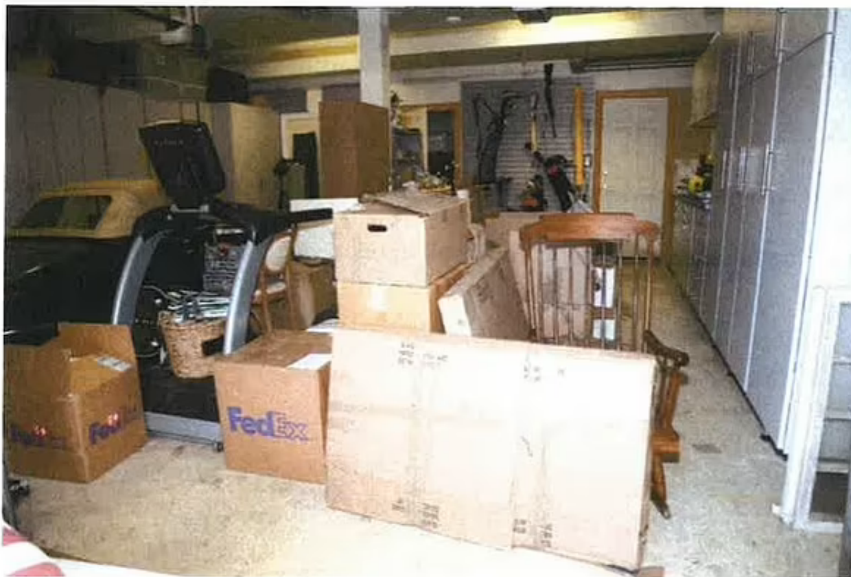
Mr. Biden's Delaware garage (Dec. 21, 2022) 536