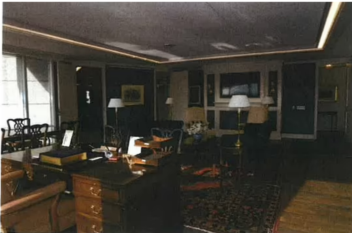
Mr. Biden's office at the Penn Biden Center (Nov. 28, 2022) 999

regarded as among the most important decisions of his vice presidency," the report said.