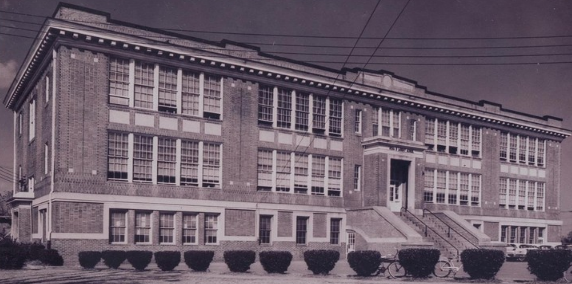
RENA B. WRIGHT ELEMENTARY SCHOOL, BUILDING 3, SOUTH NORFOLK, VIRGINIA