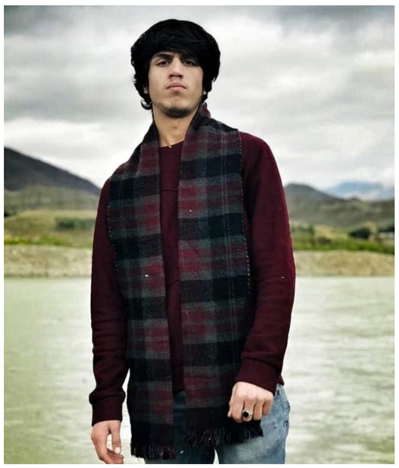
his social media profile is one of an aspiring influencer, filled with western-influenced modelling style photos.