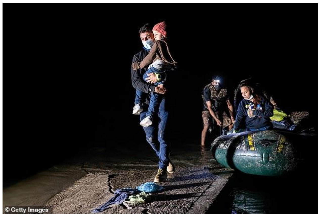
Here a raft of migrants arrives in Roma, Texas by way of the Rio Grande River on August 13 as they prepare to turn themselves over to Border Patrol for processing

A news release about the four encounters was taken down from CBP's website hours after it was published, which made Republicans question the transparency of DHS under Biden.