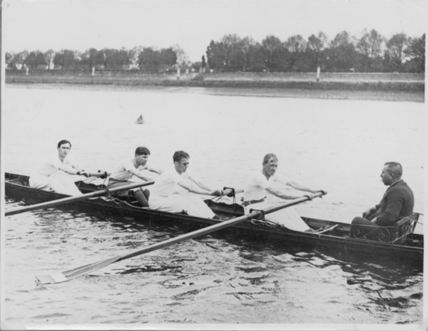
Visually impaired servicemen rowing in Hyde Park near St Dunstan's Hospital, London.