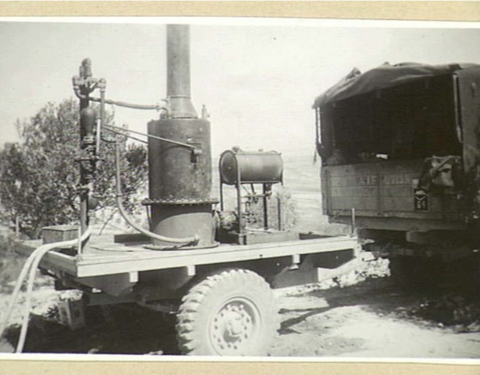
LATTAQUIE, SYRIA, 1942-04-02. THE BOILER TRUCK WITH THIMBLE BOILER AND RUTHERFORD BURNER, OF THE 9TH AUSTRALIAN DIVISION MOBILE BATH UNIT, IN OPERATION.