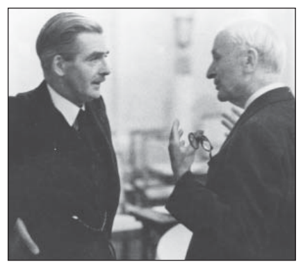
Secretary of State Cordell Hull with British Foreign Minister Anthony Eden