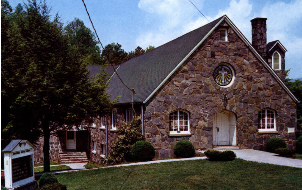
Ridgecrest Baptist Church, Black Mountain, NC