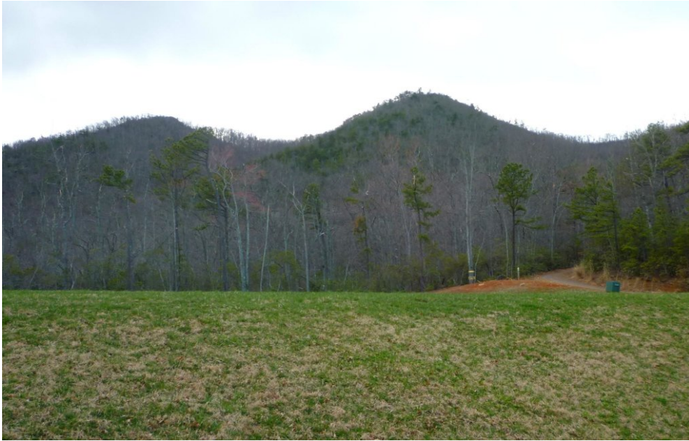
Rattlesnake Mountain (L) and Copperhead from Ridgecrest Assembly.