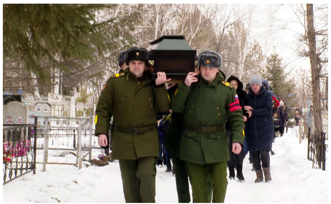
A funeral service was held in his hometown of Belogorsk, in the Amur region

But Russian senator Lyudmila Narusova, 69, claims conscripts are being ordered to sign up as contract soldiers, or thrust into this position without their knowledge.