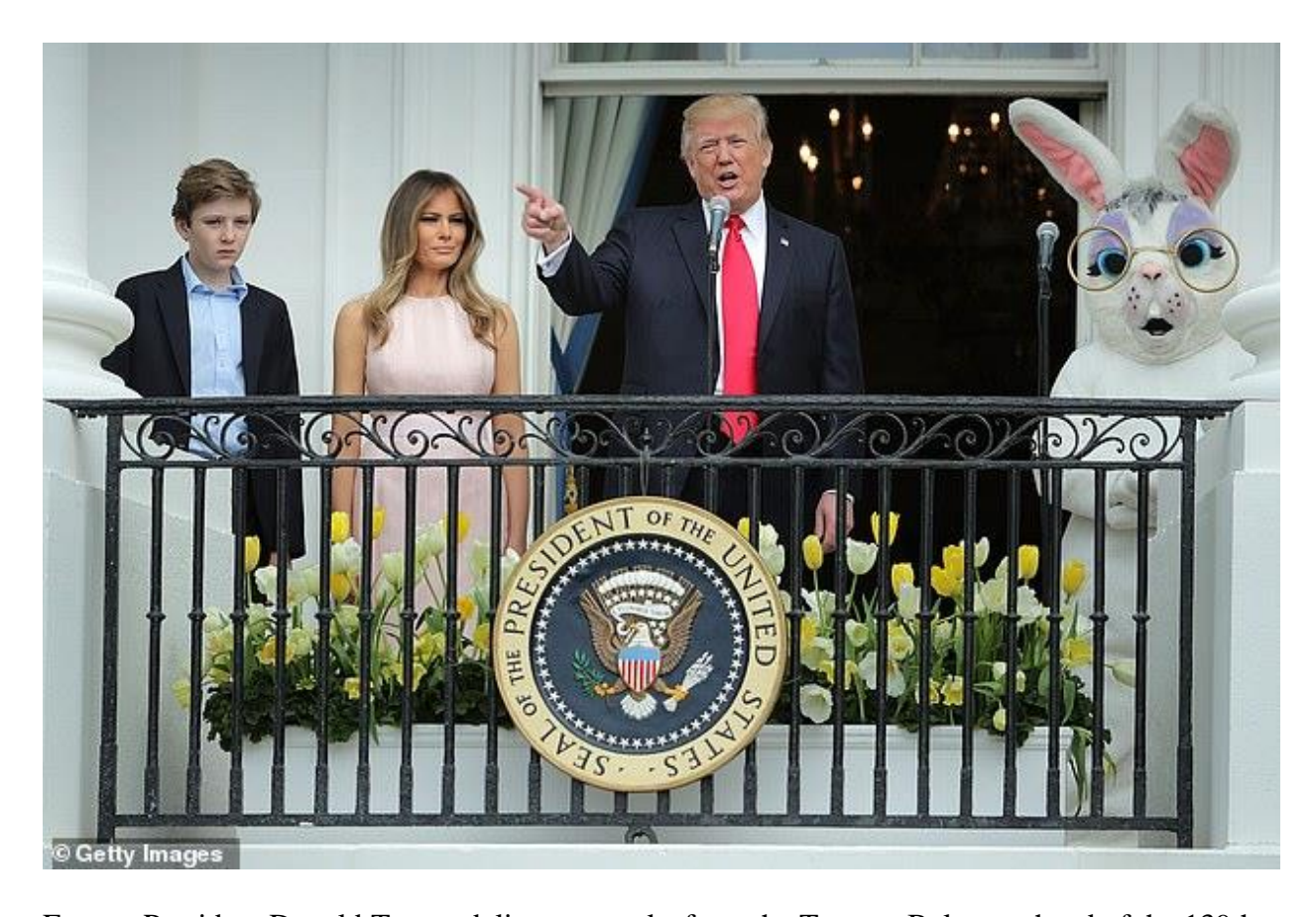
Former President Donald Trump delivers remarks from the Truman Balcony ahead of the 139th Easter Egg Roll event at the White House in 2017