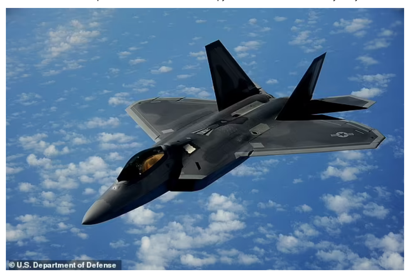
The military scrambled jets to investigate the balloon