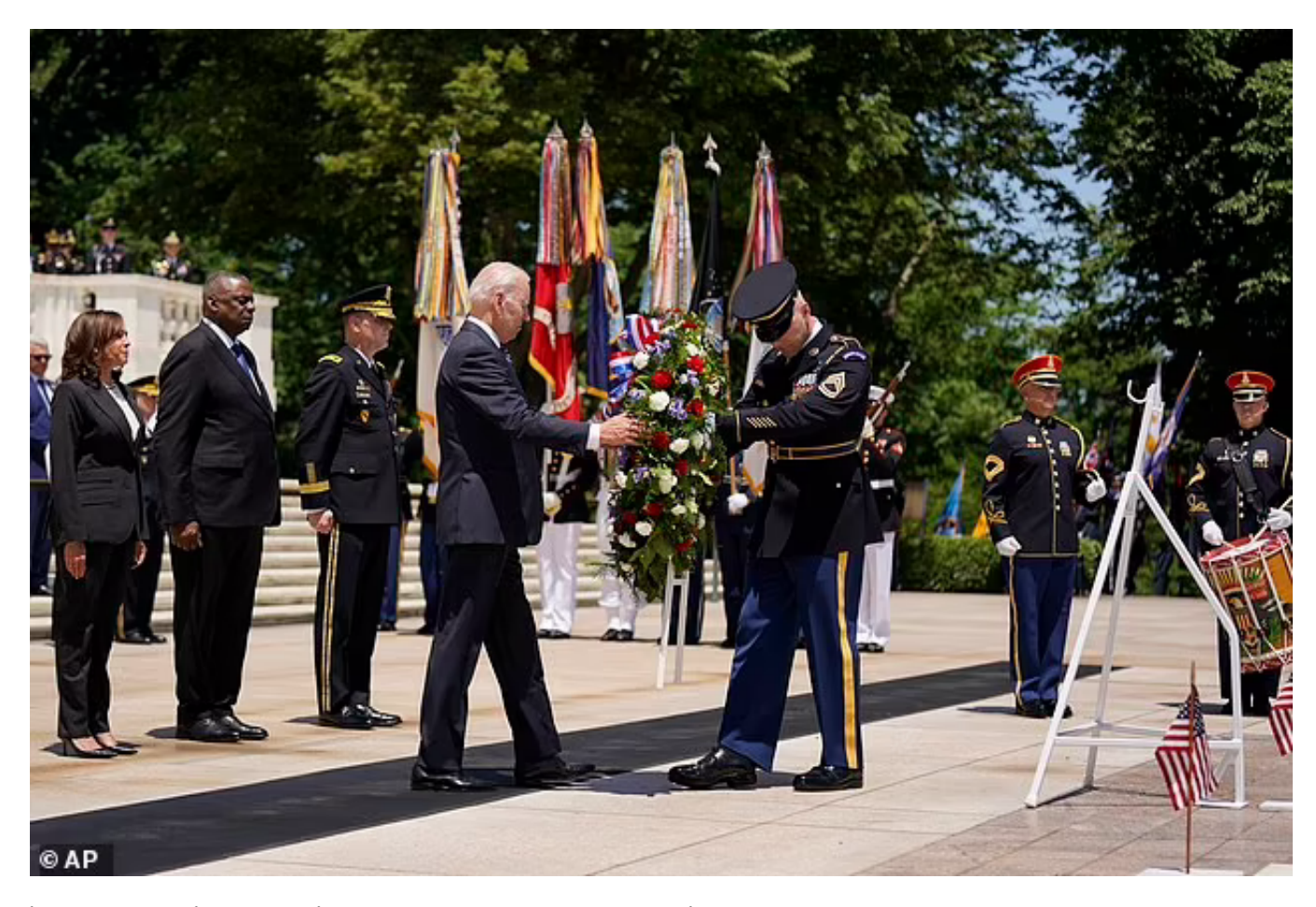
Biden at the Arlington National Cemetery event on Memorial Day 2022