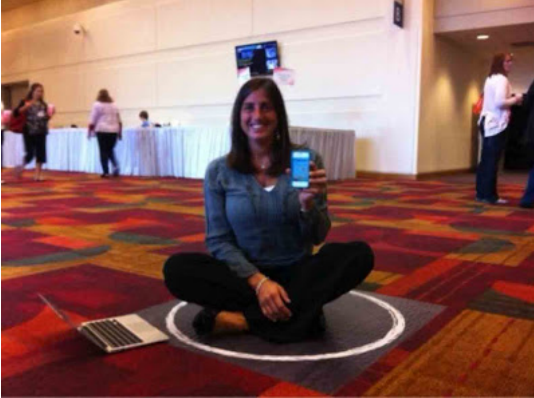
Participant at True Woman conference