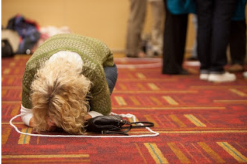
Woman at the Conference