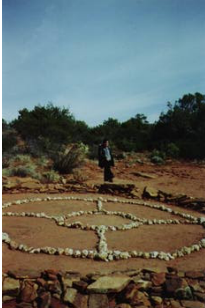
Druids prayed inside a sacred circle -