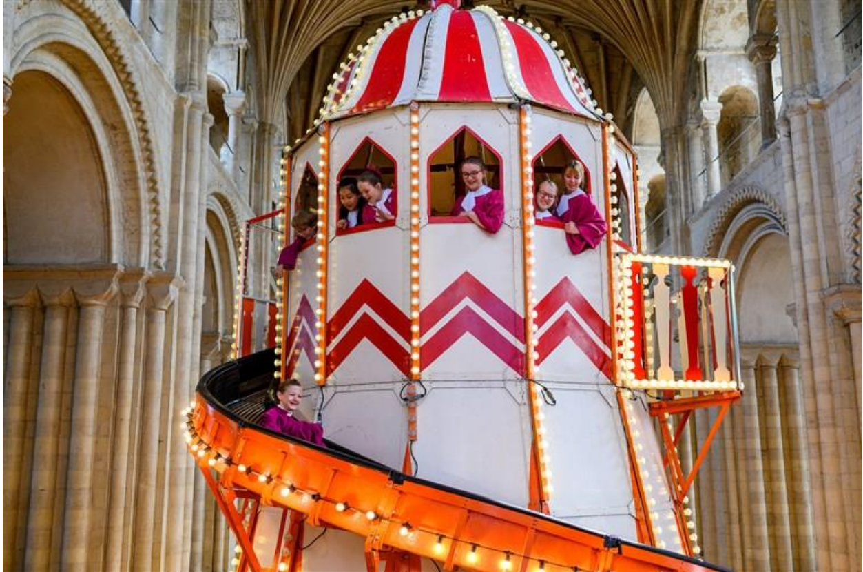
A Victorian helter skelter ride sits in Norwich Cathedral

The nave immediately above the slide features 255 of these bosses, depicting seven Old Testament episodes and seven New Testament episodes.