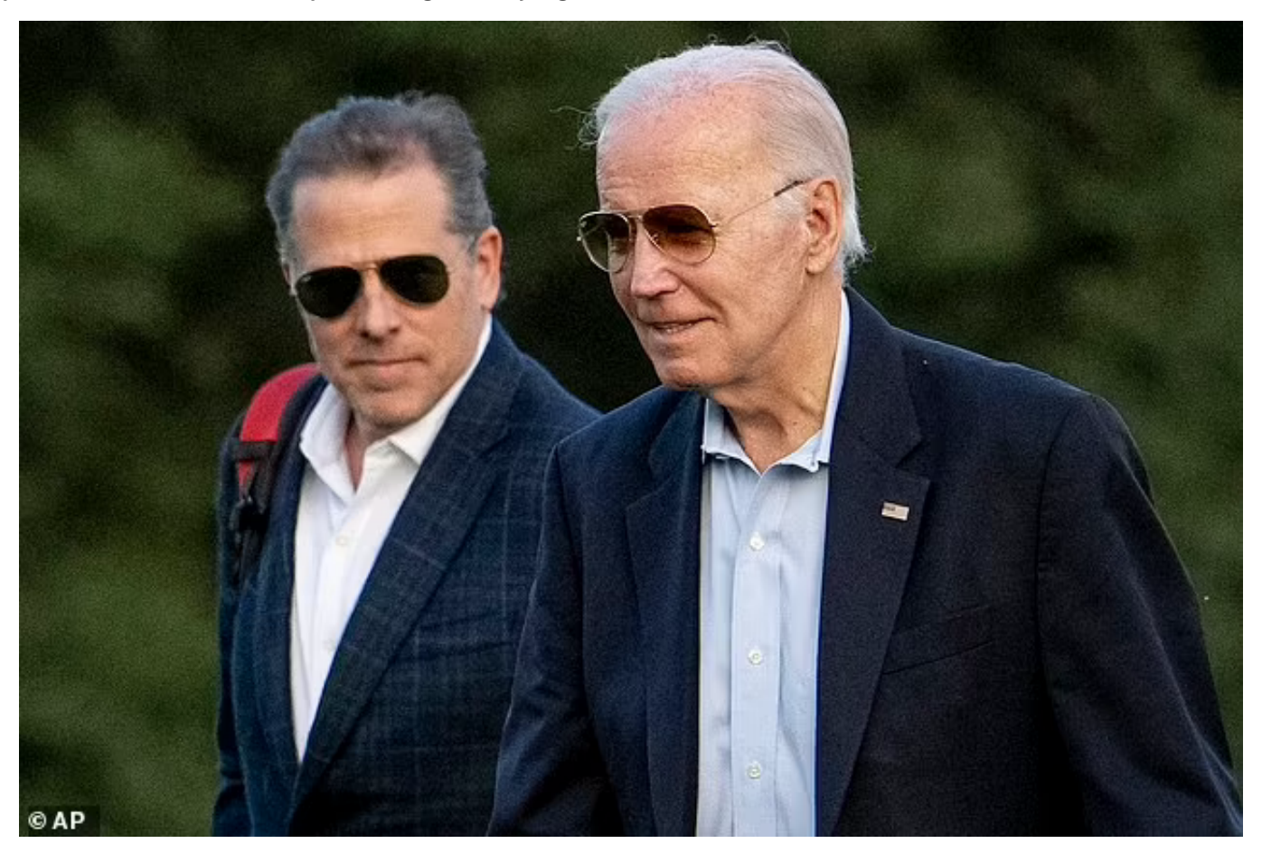
The scandal-hit first son (left) already faces a weapons charge in Delaware

It also alleges Hunter attempted 'to evade the assessment of taxes for tax year 2018 when he filed false returns in or about February 2020.'