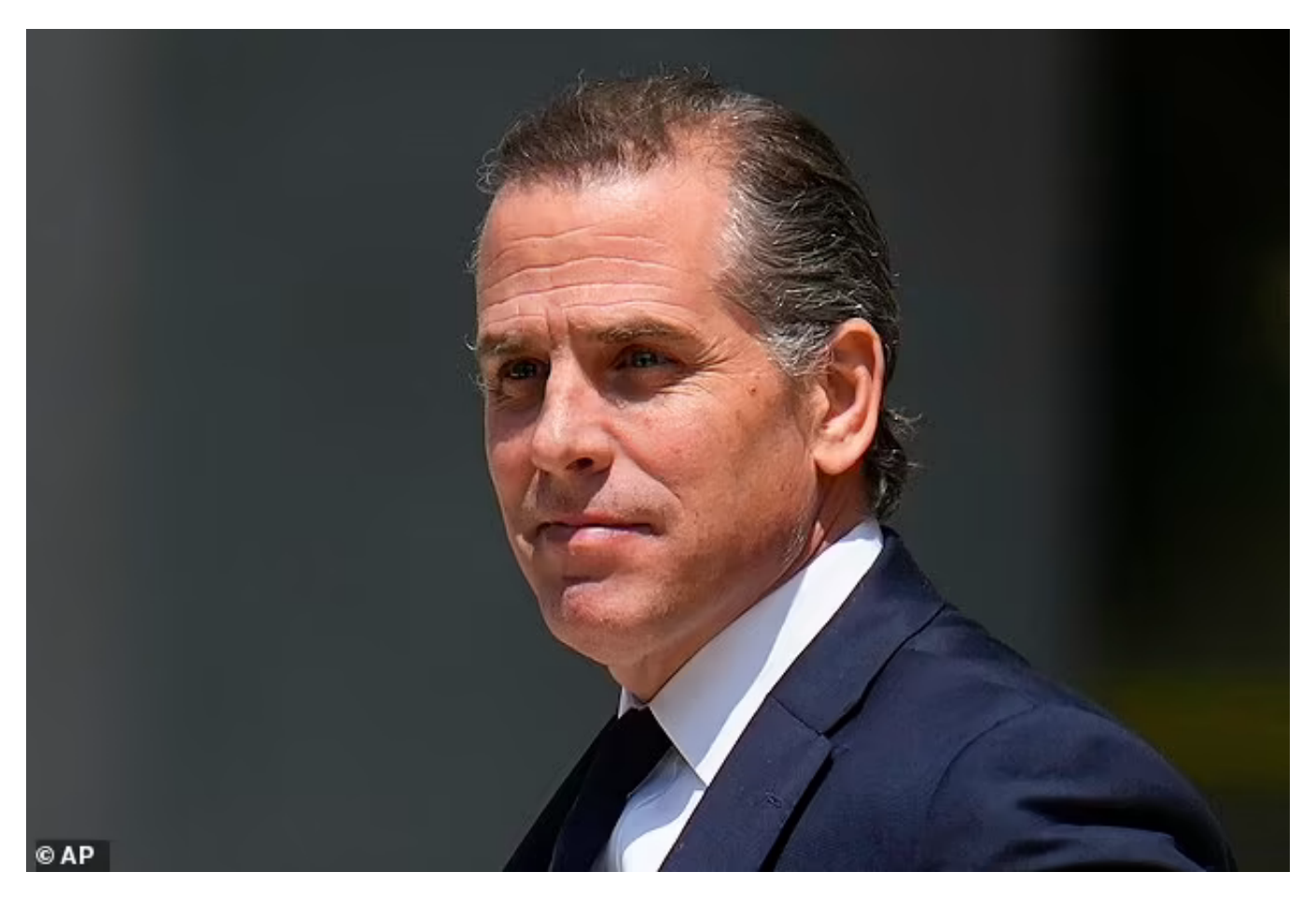
The Department of Justice has filed new criminal charges against Hunter Biden